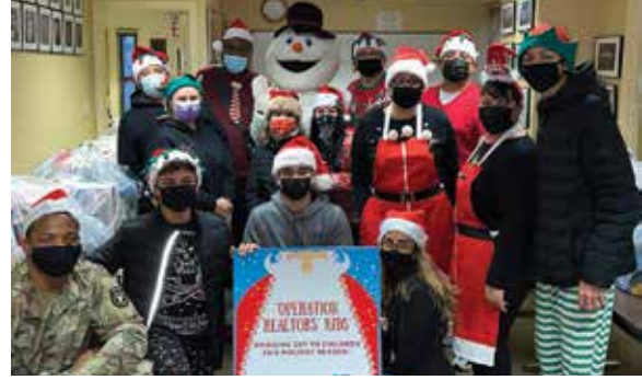
Operation REALTOR Kids Volunteers at HGAR Bronx Office