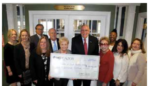
Hudson Gateway REALTOR® Foundation presents donation to Make-A-Wish Hudson Valley.