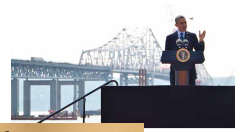
Real Estate In-Depth provided coverage of President Barack Obama's speech about the replacement of the Tappan Zee Bridge in Tarrytown in 2014 .

e devastation caused by Hurricane Sandy in 2012 at Rye Playland.