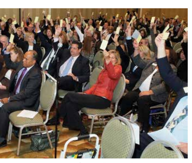
approved the merger with the Orange County ealtors and the Rockland Board of Realtors in November