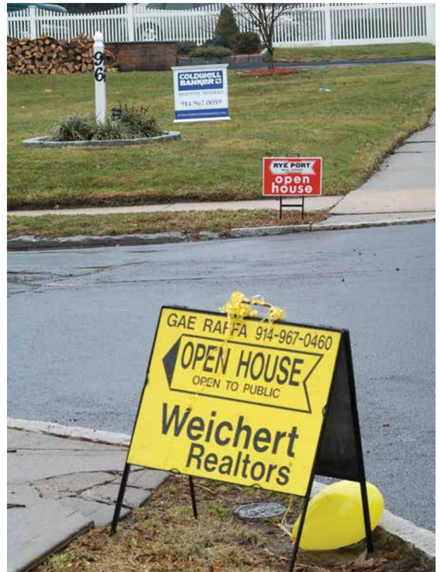
For 25 years, Real Estate In-Depth has covered the region's home sales market. For example, the newspaper reported in 2002 the Westchester average single-family home price broke the $500,000 barrier for the first time. Five years later, the housing market saw home sales decline 13%, a precursor to the recession that followed.